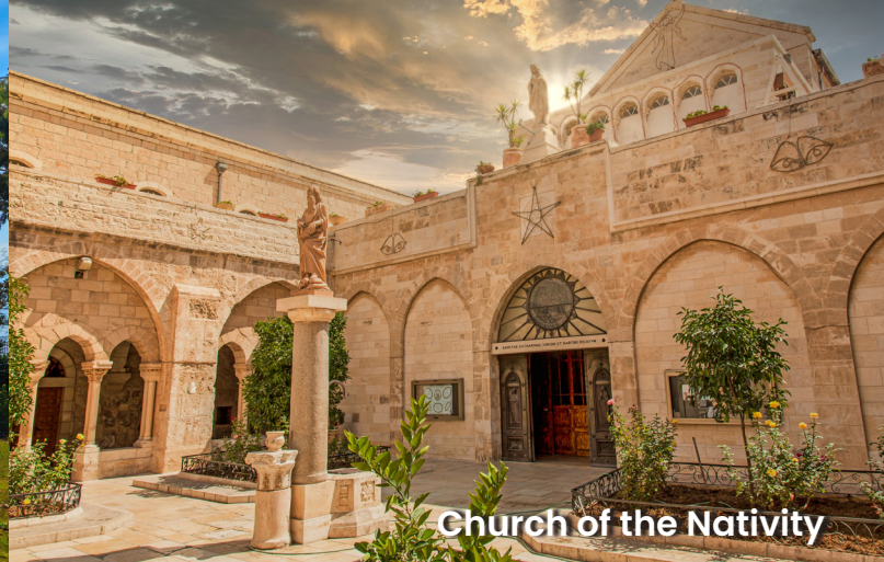
Church of the Nativity