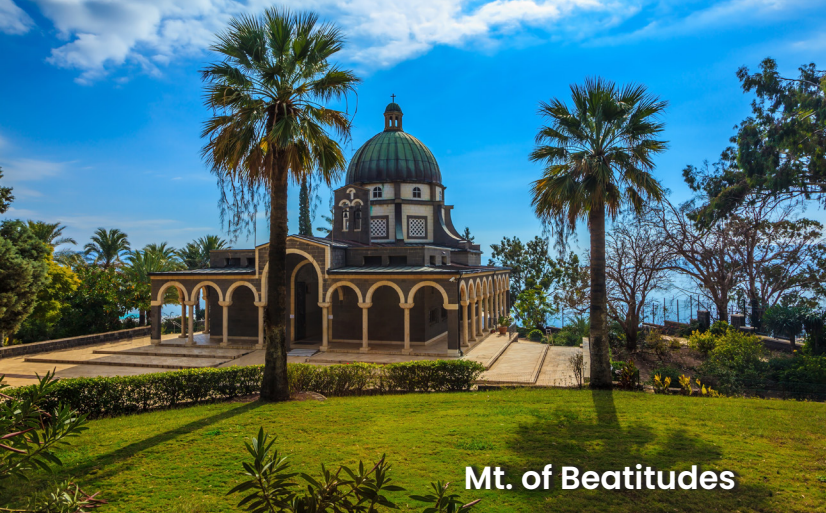
Mt. of Beatitudes